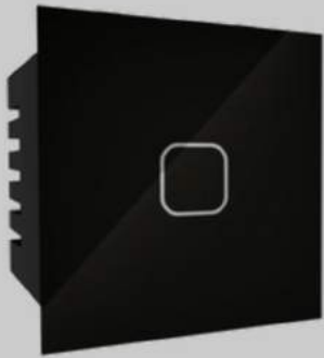
1 Gang(25 amp)

Easy installation with existing wiring in residential or commercial premises