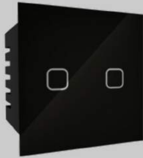
2 Gang(16 amp each)