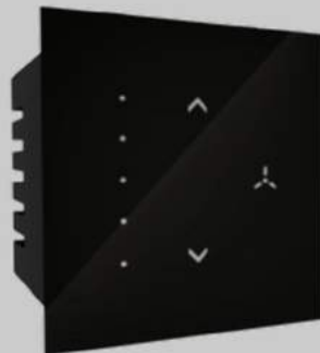
5 Step Fan Regulator